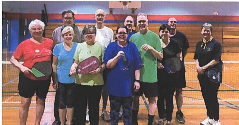
Pickleball Tournament Players