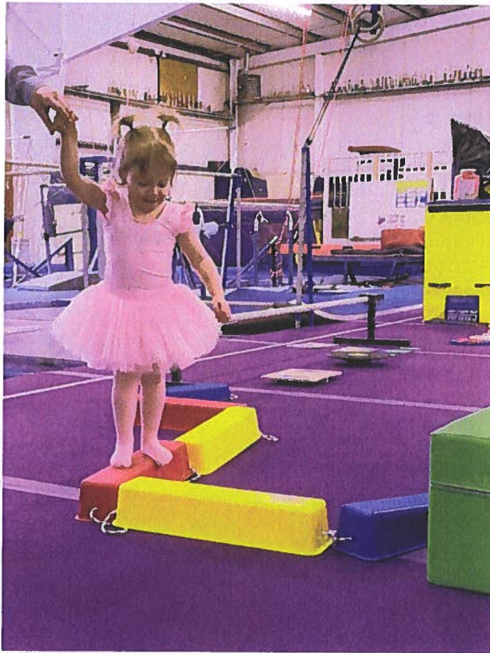
St. Paddy's Day Preschool Party Princess 2019